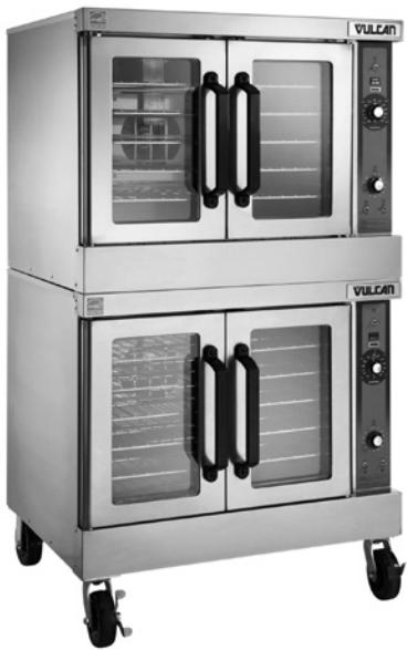
Model VC44GD shown with optional casters