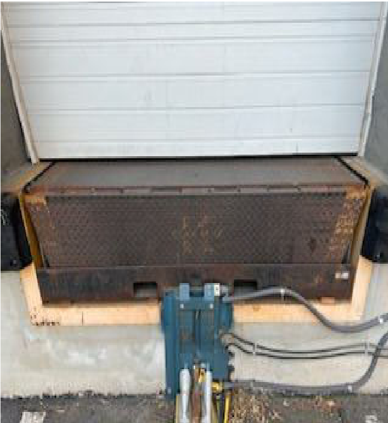
Exhibit 2 Visual of Docks Lock (1EA) and associated equipment; 36 Box Car Road, Middletown, PA 17057