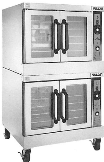
Model SG44 shown with optional casters